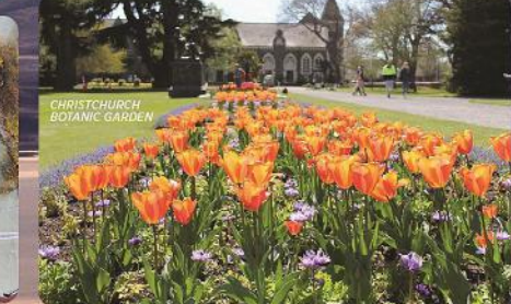
CHRISTCHURCH BOTANIC GARDEN