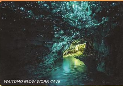
WAITOMO GLOW WORM CAVE